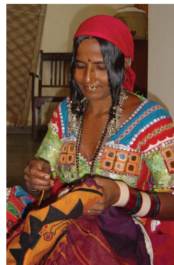
A Kutchi woman embroidering

The various tribes inhabiting the north-east of India live among the rich bamboo forests where the finest quality of skill in the weaving of bamboo, cane and other wild grasses can be seen. This group links itself culturally to the people