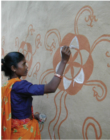
Wall and floor decoration in a house, Jharkhand